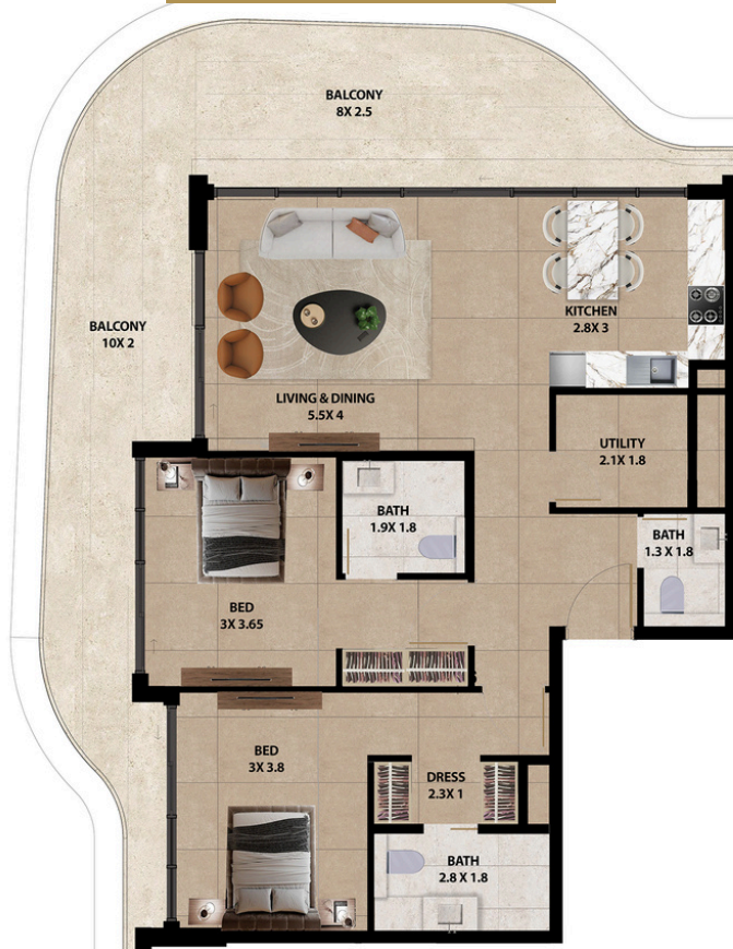
2 BHK TYPE 3