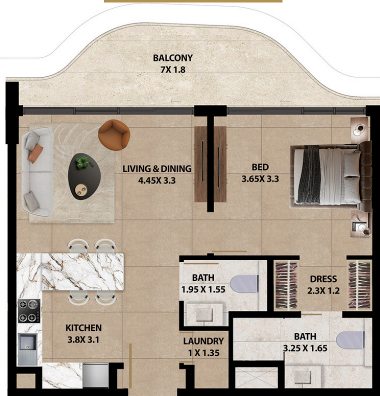
1 BHK TYPE 2