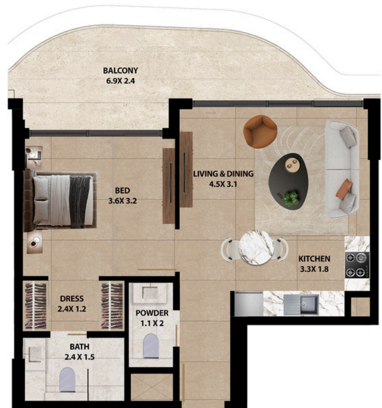
1 BHK TYPE 1

ELEGANT 1 & 2-BEDROOM APARTMENTS FEATURING EXPANSIVE LAYOUTS AND 23,000 SQ. FT. OF THOUGHTFULLY CURATED LUXURY AMENITIES AND LIFESTYLE SPACES.